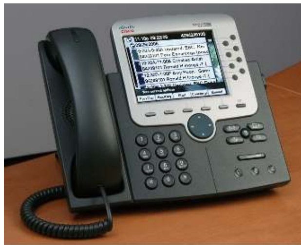
Figure 2. Meetings Posted on Cisco Unified IP Phone 7970G Display for One-Button-to-Push Call Launch